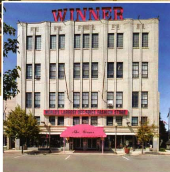
JUST ACROSS THE STREET FROM REYERS IS THE WINNER, WHERE ANY WOMAN IS A WINNER TRYING TO FIND FORMAL WEAR.