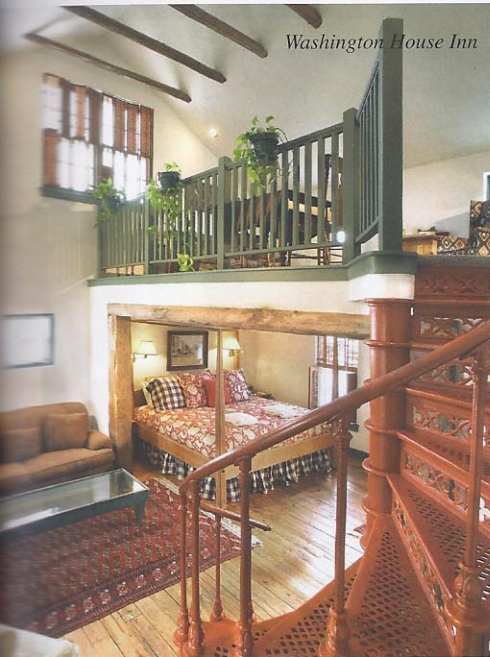
Washington House Inn